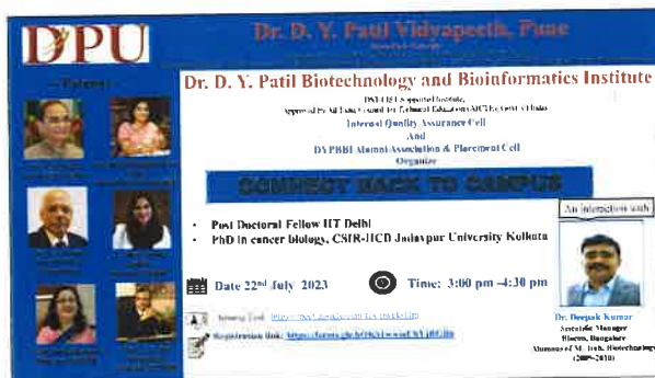
Flyer for the Program