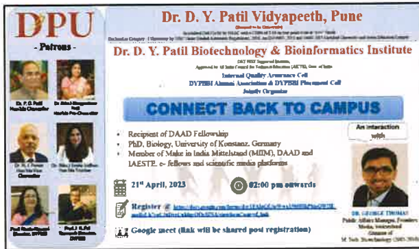
Flyer for the Program